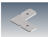
JN-90 90 degree joiner