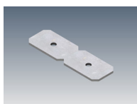
JN-ST Straight joiner